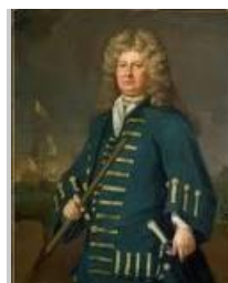
Admiral Sir Cloudesley Shovell

The Tercentary of the Naval disaster of 1707 was commemorated by a special series of events on the Isles of Scilly (and elsewhere) in October 2007.