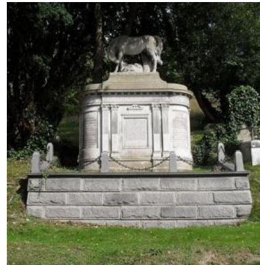
The Ginnett monument - A statue of a circus pony, its head lowered in sorrow, dominates the structure.