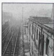
Den Mark 1 - Old Leigh Railway Station.

They form a very important part of the Old Town and its life - so here's to the next 75.