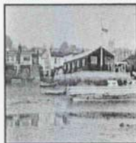
Den Mark 3 - Victoria Wharf, Old Town.