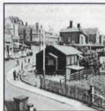
Den Mark 2 - Bottom of Leigh Hill.