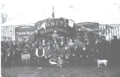
Circus Ginnett in later years